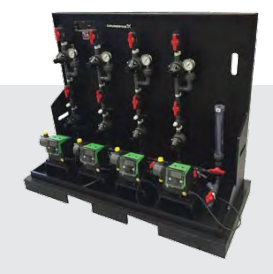
DOSING SKID SYSTEM