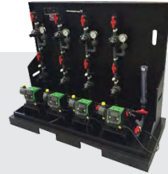
DOSING SKID SYSTEM