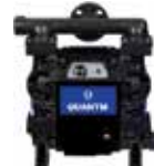
AIR-OPERATED & ELECTRIC DIAPHRAGM PUMPS