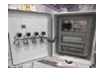
UL CONTROL PANELS