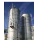
CARBON AND STAINLESS STEEL TANKS